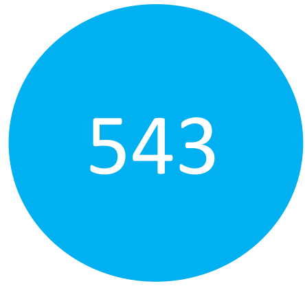
Number of properties sold in Helensvale in 2016