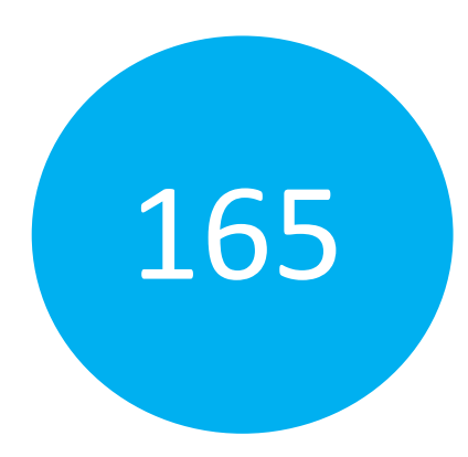
Properties Currently For Sale